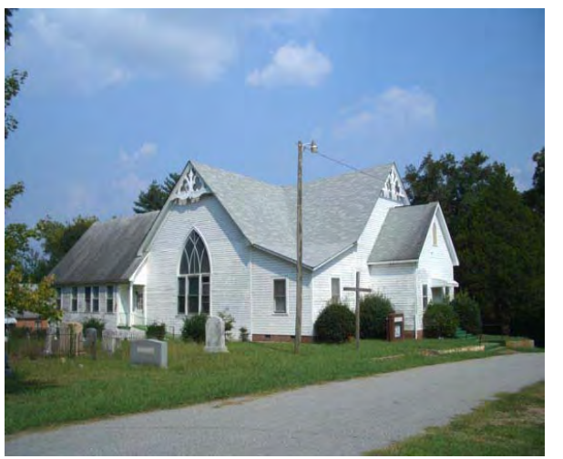
GOLS at former Glendale UM Church property