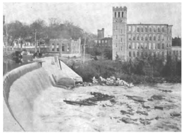
Glendale in the mid-1920's