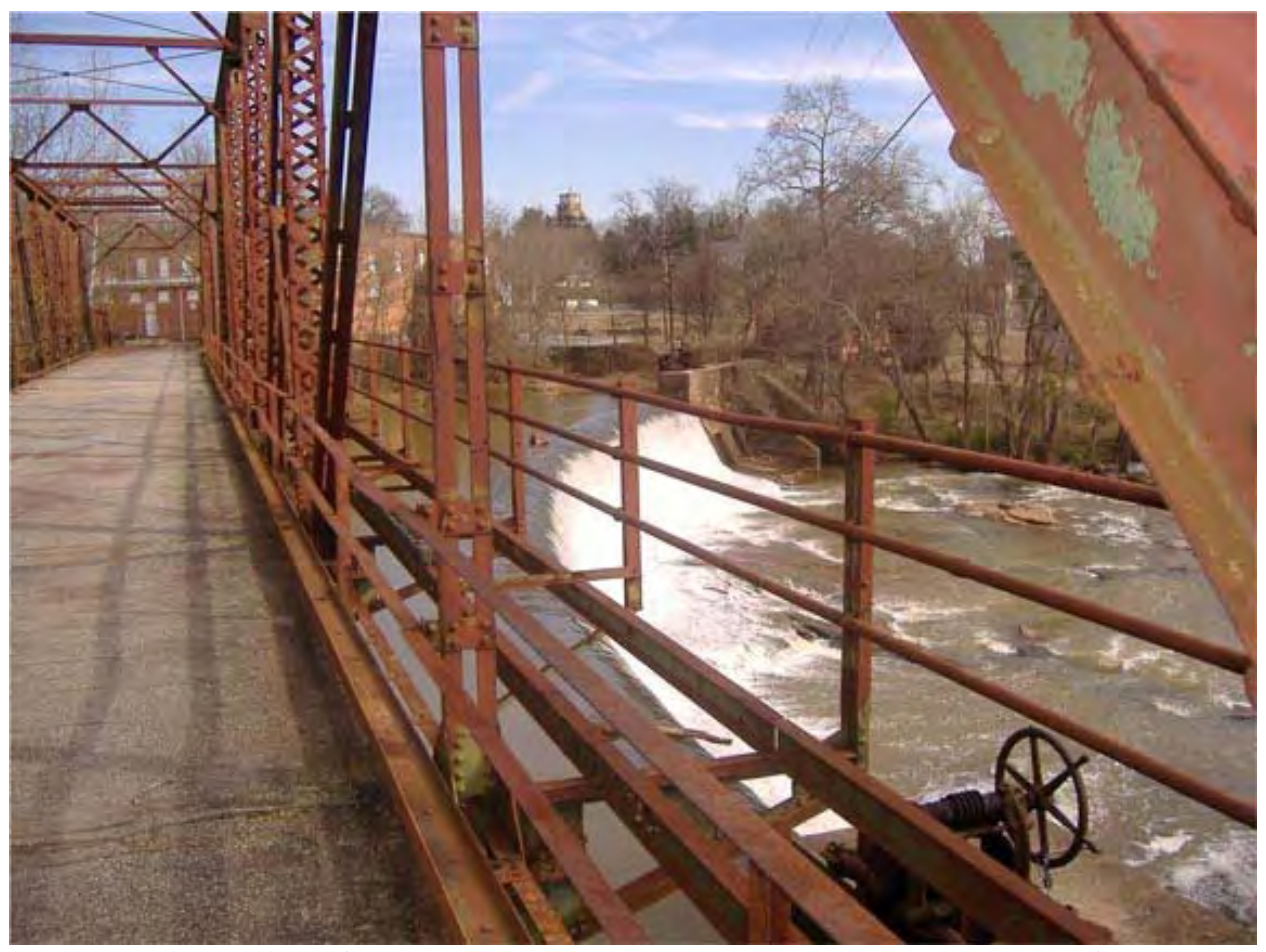
The old iron bridge, former company store, water tank, dam, and shoals at Glendale